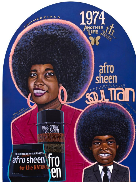
William Scott, Untitled , acrylic on canvas, 2019.

This year's fair will feature two curated presentations: a celebration of Creative Growth Art Center's 50th anniversary, and an exhibition of artworks by the Beat Generation poets